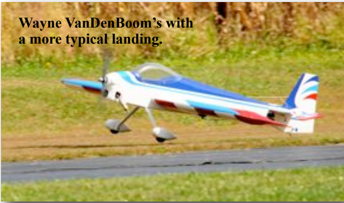
Wayne VanDenBoom's with a more typical landing.