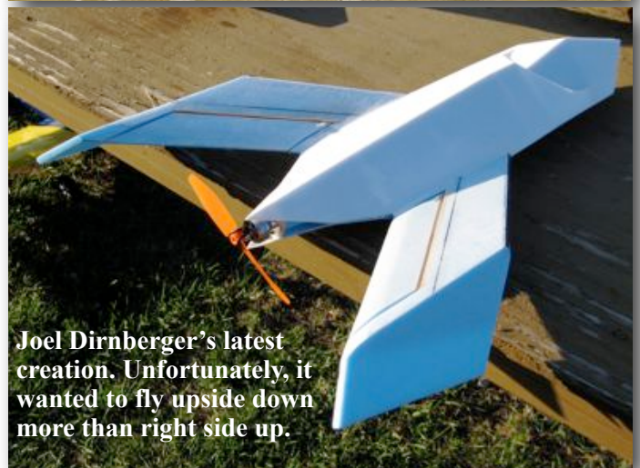
Joel Dirnberger's latest creation. Unfortunately, it wanted to fly upside down more than right side up.