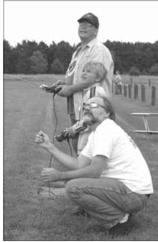
Scouts flying with a little help.