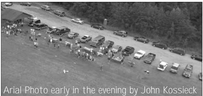
Arial Photo early in the evening

The club had performed this same "show" for a Cub Scout pack last year but the attendance for this one had to have been at least double that of last year. Had we foreseen the onslaught of people for this event, we may well have panicked. Nevertheless, we had enough aircraft and pilots to support this event and make it an unqualified success. Thanks again to everyone who helped make this such a successful event.