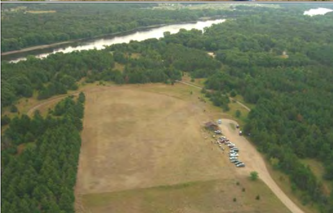
John Kossieck's aerial view of the Cubs Scout Night