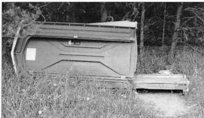
Topped Toilet—need we say more?