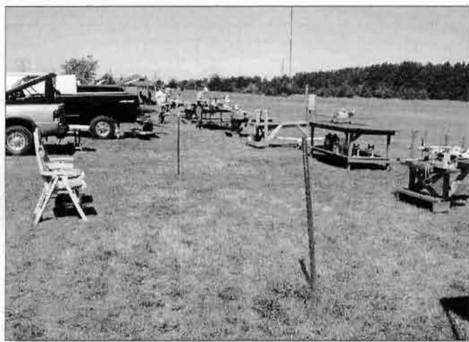
A great time was had by WFRC members at the Fun-Fly Picnic. Several of the wives attended as well. Good to see you all there!!