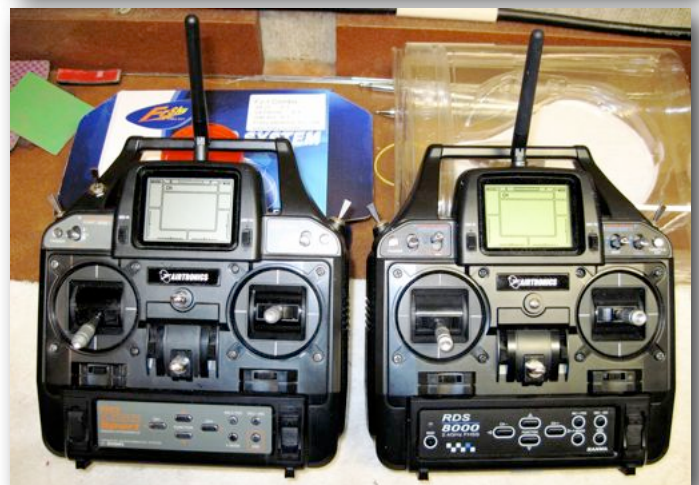
RD6000 DIY conversion (left) along side Airtronics RDS8000 radio factory produced spread spectrum (right)